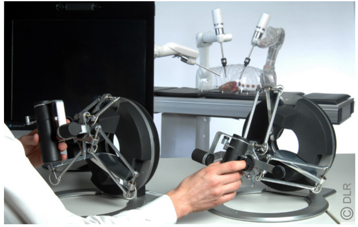
Figure 1: The MiroLab MIRS system

RMC is a world leading robotics research cluster and the competence center for DLR research and development in the areas of robotics, mechatronics, and optical systems. RMC specializes in the interdisciplinary design, computer-aided optimization, simulation and implementation of complex mechatronic systems and human-machine interfaces.