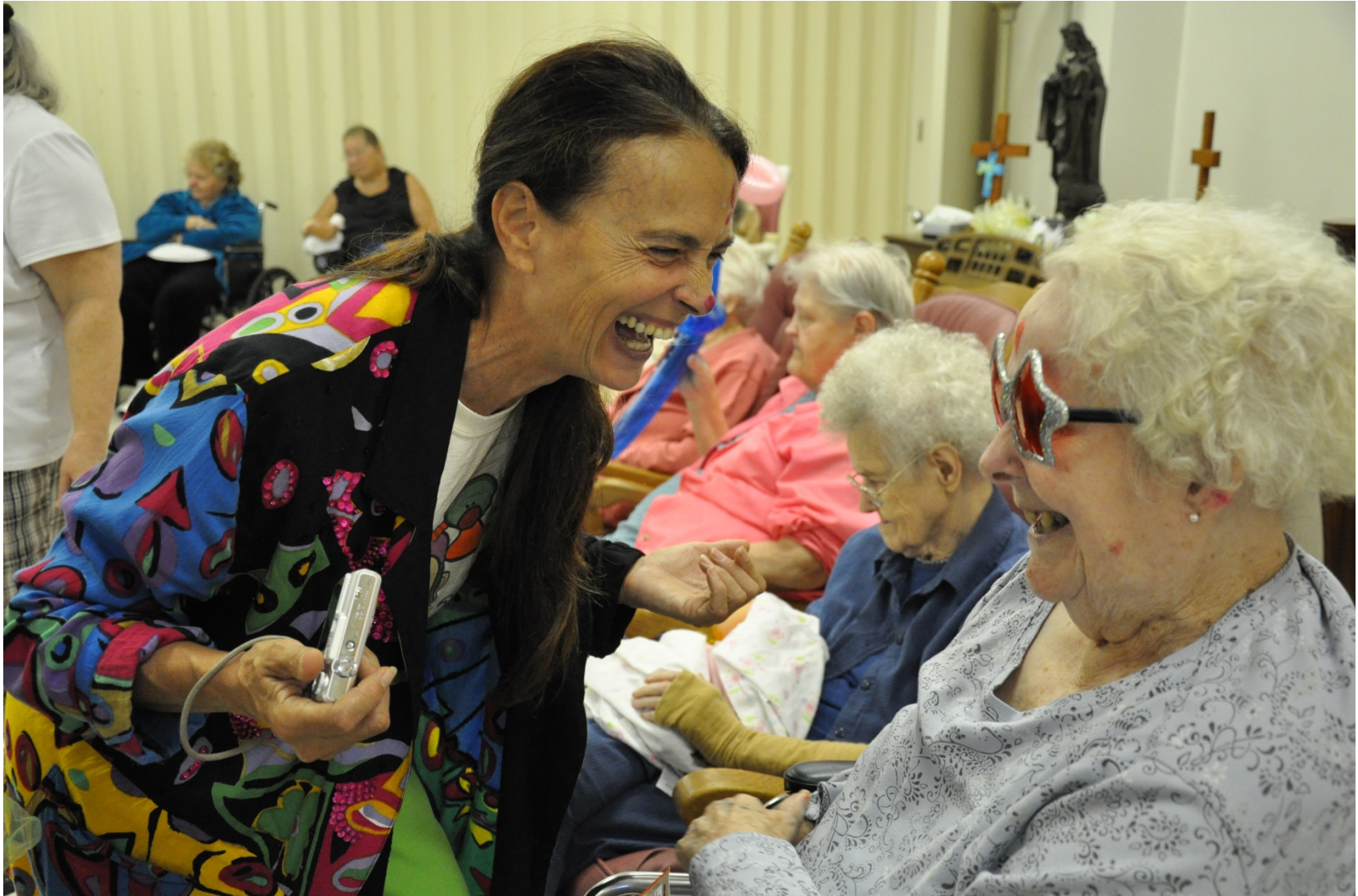
Creative commons licence. Nursing home clown by Kara Newhouse