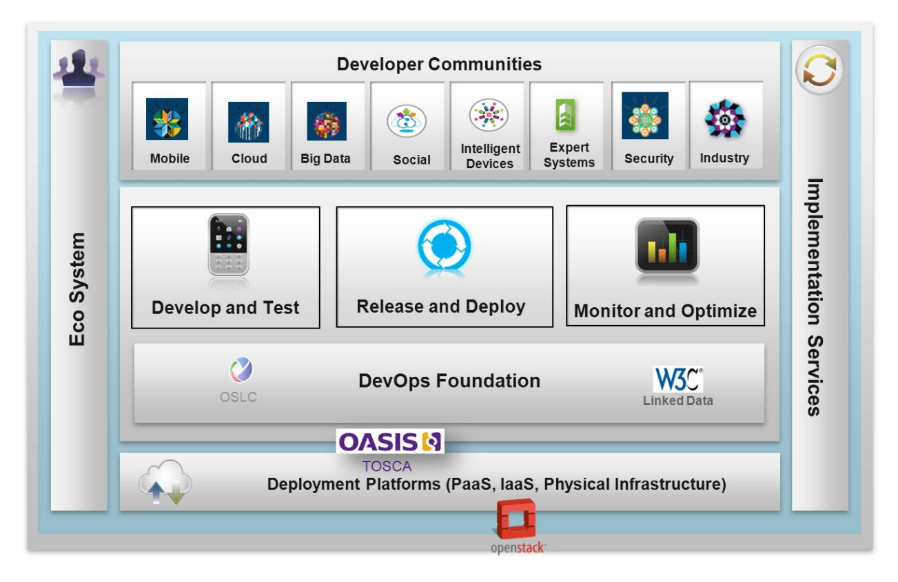
Figure 1: DevOps Reference Architecture

Leveraging a DevOps reference architecture is important to help organizations define the capabilities and tools that will be used to implement their DevOps environment. The reference architecture should embrace open standards where possible. Figure 1 includes an example DevOps reference architecture with key standard technologies called out specifically in the area of cloud and lifecycle integration.